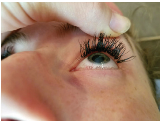
Figure 4: Chemical conjunctivitis (bottom) in same eye due to the eyelash extension adhesive.