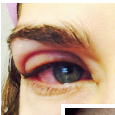
Figure 5: Marked allergic reaction (left) 1 day after application of eyelash extensions. Patient had extensions removed same day due to allergic reaction.

Patients should appreciate that their eyelids are delicate and need gentle care: lightly soak (warm compress), gently scrub, avoid soaps/detergents and gently condition (with hyaluronic acid-containing moisturizers). HA moisturizers are excellent humectants for the skin and lashes, but watch out for detrimental co-ingredients